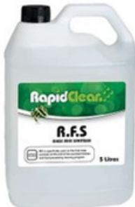
Rinse Free Sanitizer Code: 140490 Size: 5L, 15L