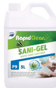
Sani-Gel Hand Sanitizer Code: 141245 Size: 5L, 15L