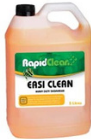
Easi Clean Degreaser Code: 140140 Size: 5L, 15L