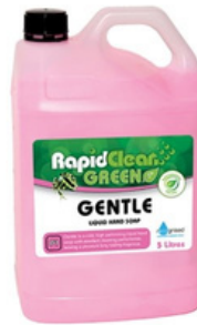
Gentle Pink Hand Wash Code: 140580 Size: 5L, 15L