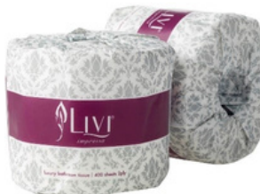
Livi Impresa Toilet Tissue 2ply Code: 8803140 Carton of 48 rolls