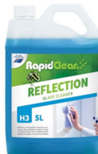
Reflection Glass Cleaner Code: 140340 Size: 5L, 15L