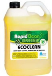
EcoClean Sanitizer Code: 140500 Size: 5L, 15L