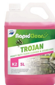
Trojan Floor Cleaner Code: 140030 Size: 5L, 15L