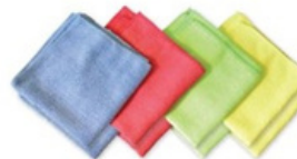
Microfibre Cleaning Cloth Code: 65151 50 per box