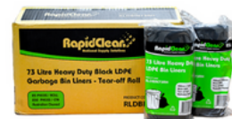
Heavy Duty Black LDPE Garbage Bags 73L Roll Code: RLDBIN73H 73L, 82L, 120L, 240L