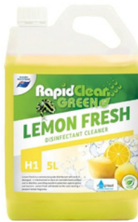
Lemon Fresh Disinfectant Code: 140300 Size: 5L, 15L