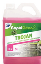
Trojan Floor Cleaner Code: 140030 Size: 5L, 15L