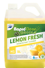
Lemon Fresh Disinfectant Code: 140300 Size: 5L, 15L