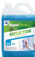
Reflection Glass Cleaner Code: 140340 Size: 5L, 15L