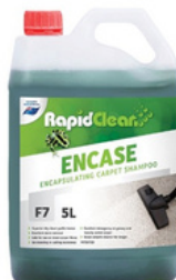
Encase Encapsulating Carpet Shampoo Code: 8804650 Size: 5L