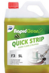
Quick Strip Code: 8804630 Size: 5L