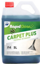
Carpet Plus Code: 8804640 Size: 5L