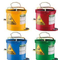
Roller Wringer Bucket Code: 8801280