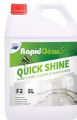
Quick Shine Code: 8804610 Size: 5L