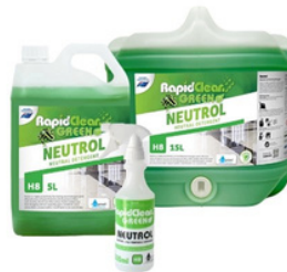
Neutrol Low Foaming Detergent Code: 8804620 Size: 5L, 15L