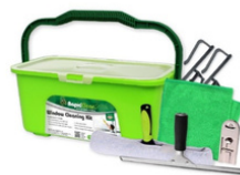
Window Cleaning Kit Available on request