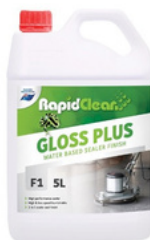
Gloss Plus Code: 8804630 Size: 5L